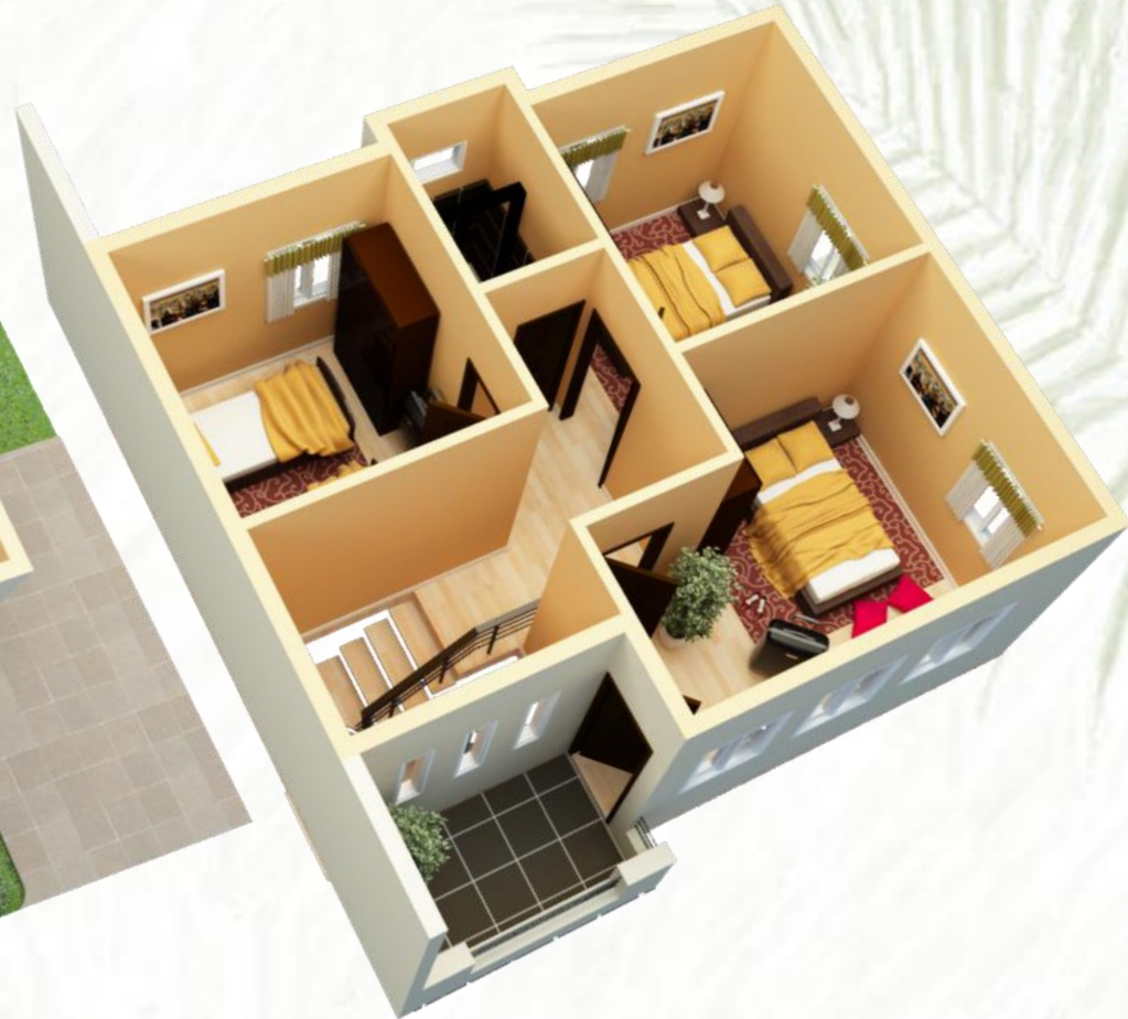
2 nd Floor