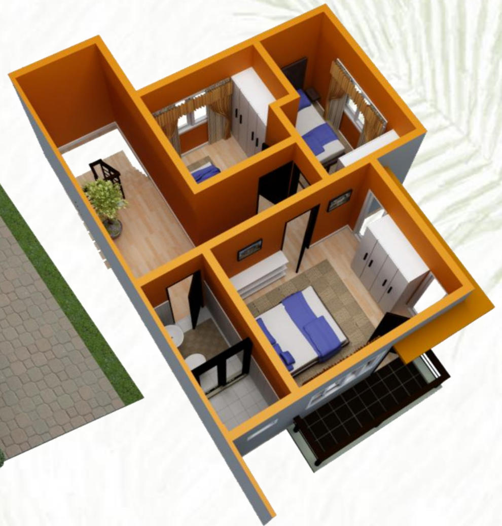
2 nd Floor