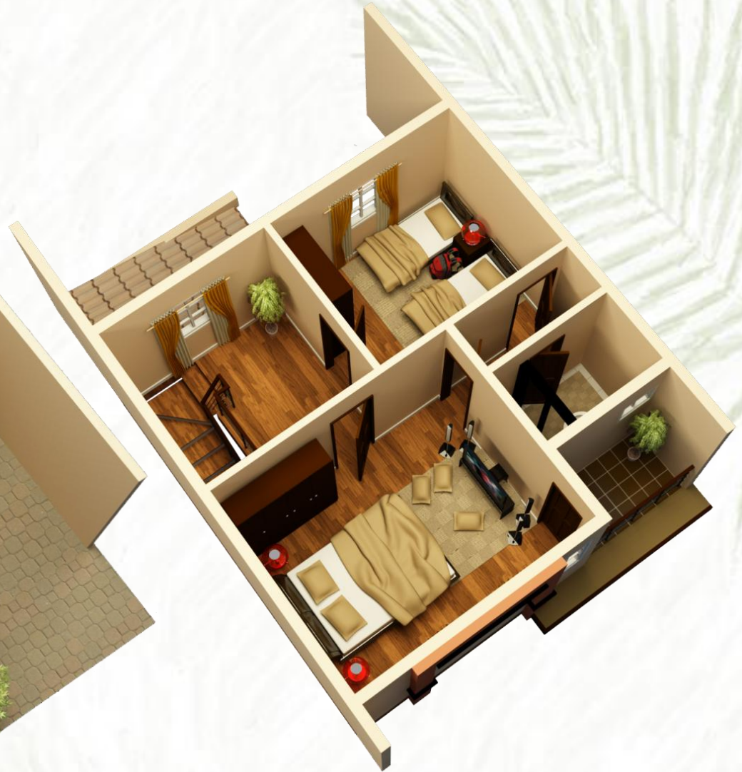
2 nd Floor